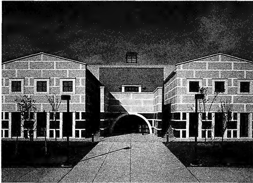
Fig. 1 Graves, "St. School north facade"

This picture shows another entrance to the school, which is perpendicular to the hallway. Many features are repeated throughout all three pictures, for example magnification and simplicity. The large bricks look roughly like building blocks stacked up together. It is a very simple design because of the organized repetition. The bricks are not real but painted making it resemble a drawing by a child. The size of the bricks is exaggerated. As opposed to having many small bricks, the large bricks minimize visual texture. The shapes are also clearer this way and add to the general simplicity of the school. Three colors can be seen on this façade. These are red blue and yellow; the primary colors. These colors are well known and discernable but they also create many pleasant atmospheres. Red provokes thrill and enthusiasm, yellow provokes happiness and tranquility and blue is serene. All these colors combined create a childish and friendly atmosphere.